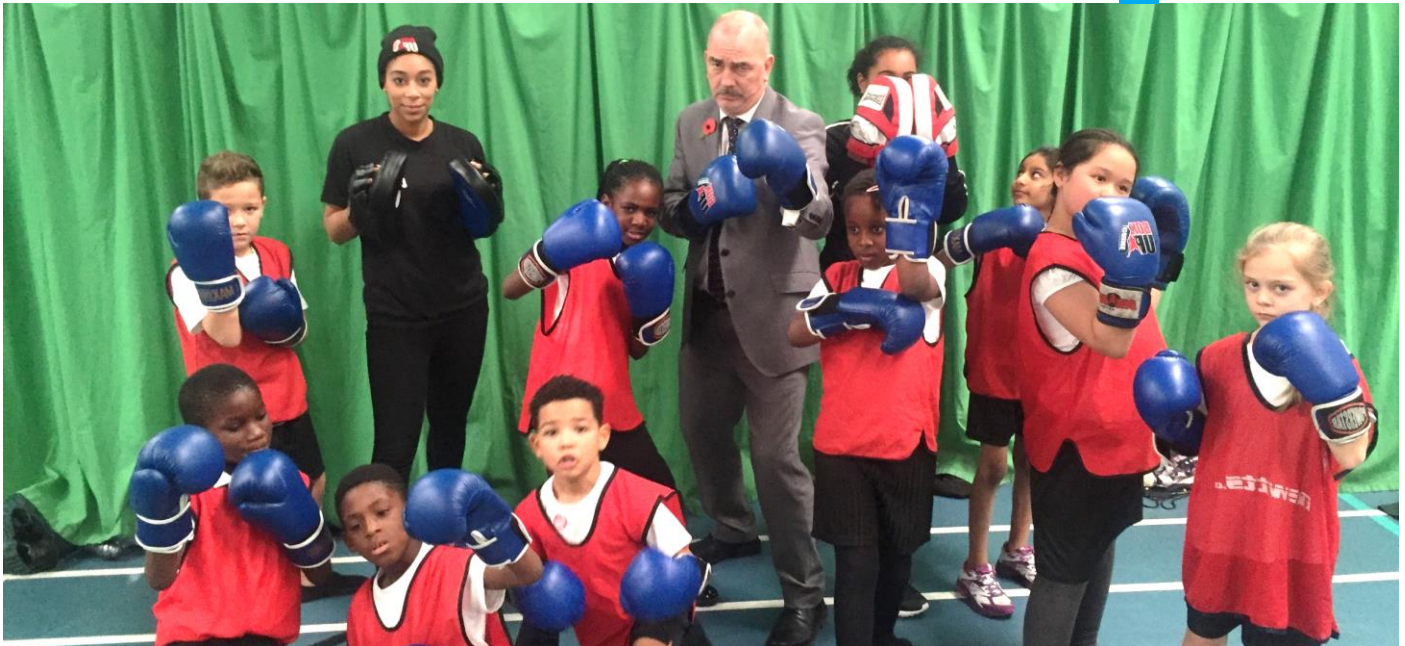
Sport Inspired Community Games Festival