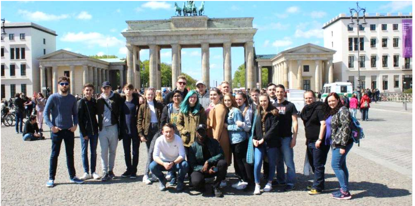
Year 13 History Rome - Berlin Trip