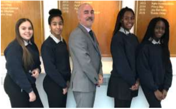
This week's Gold Seagull winners!