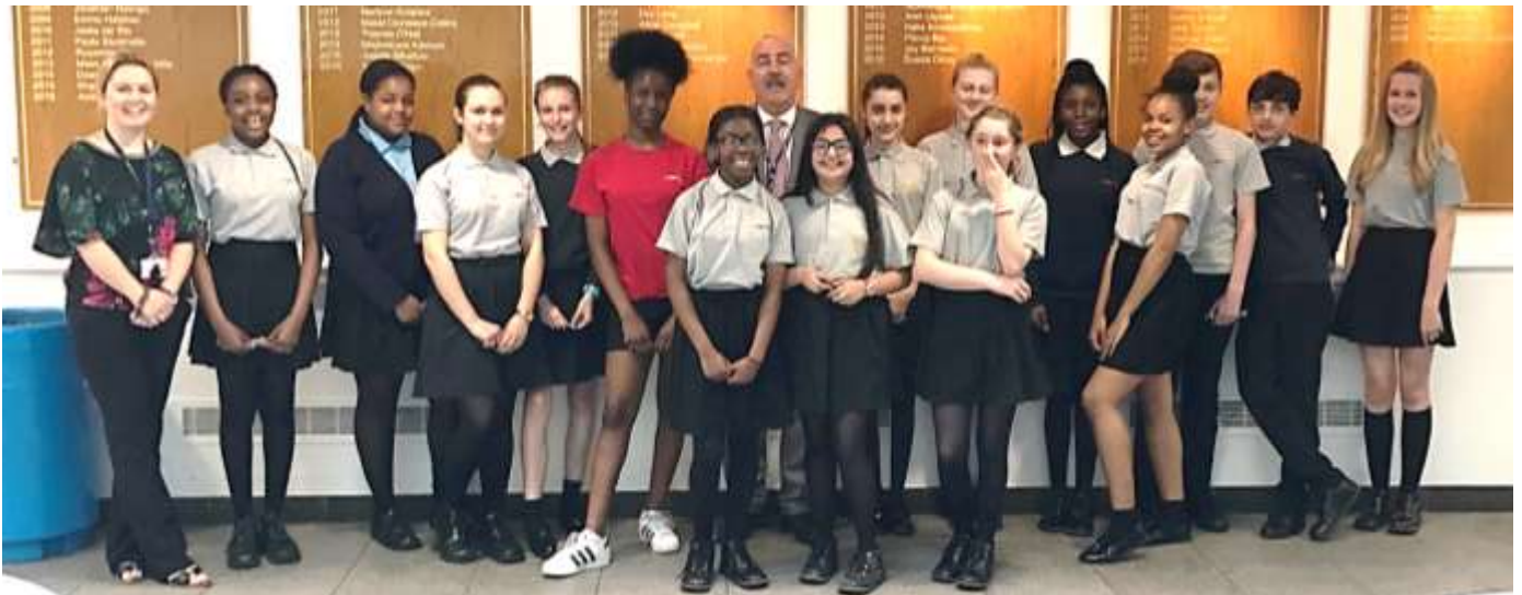
This week's Gold Seagull winners