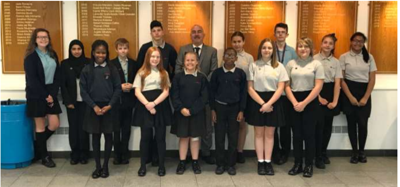
This week's Gold Seagull winners