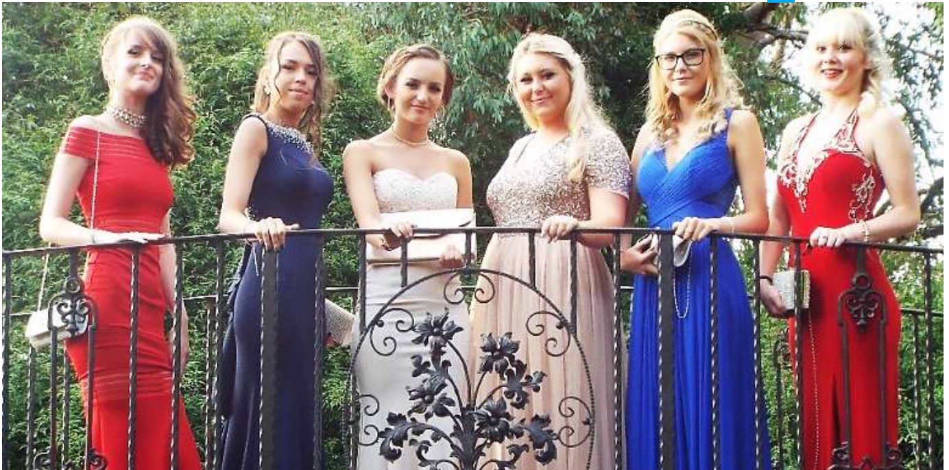
JRCS PROM 2017 (more photos on pages 6 & 7)