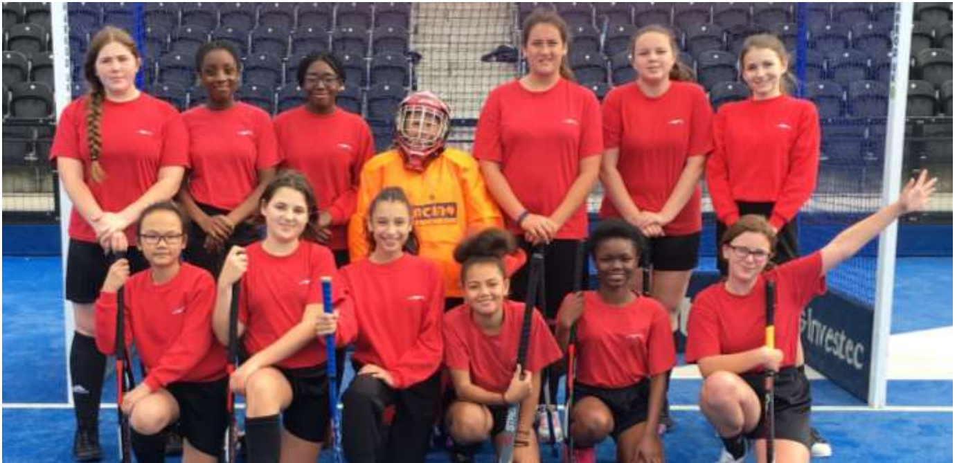
Year 8 girls represent Barking & Dagenham at The London Hockey Festival