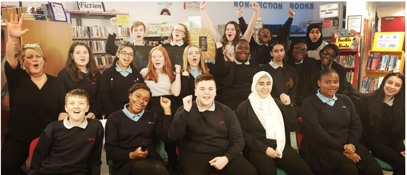
19 JRCS students live stream to five cities across North America