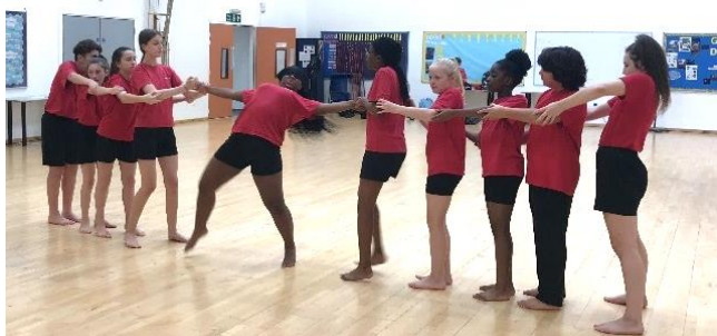
Miss England Head of Dance

and torture that occurred during slavery. Well done Wings and excellent first performance.