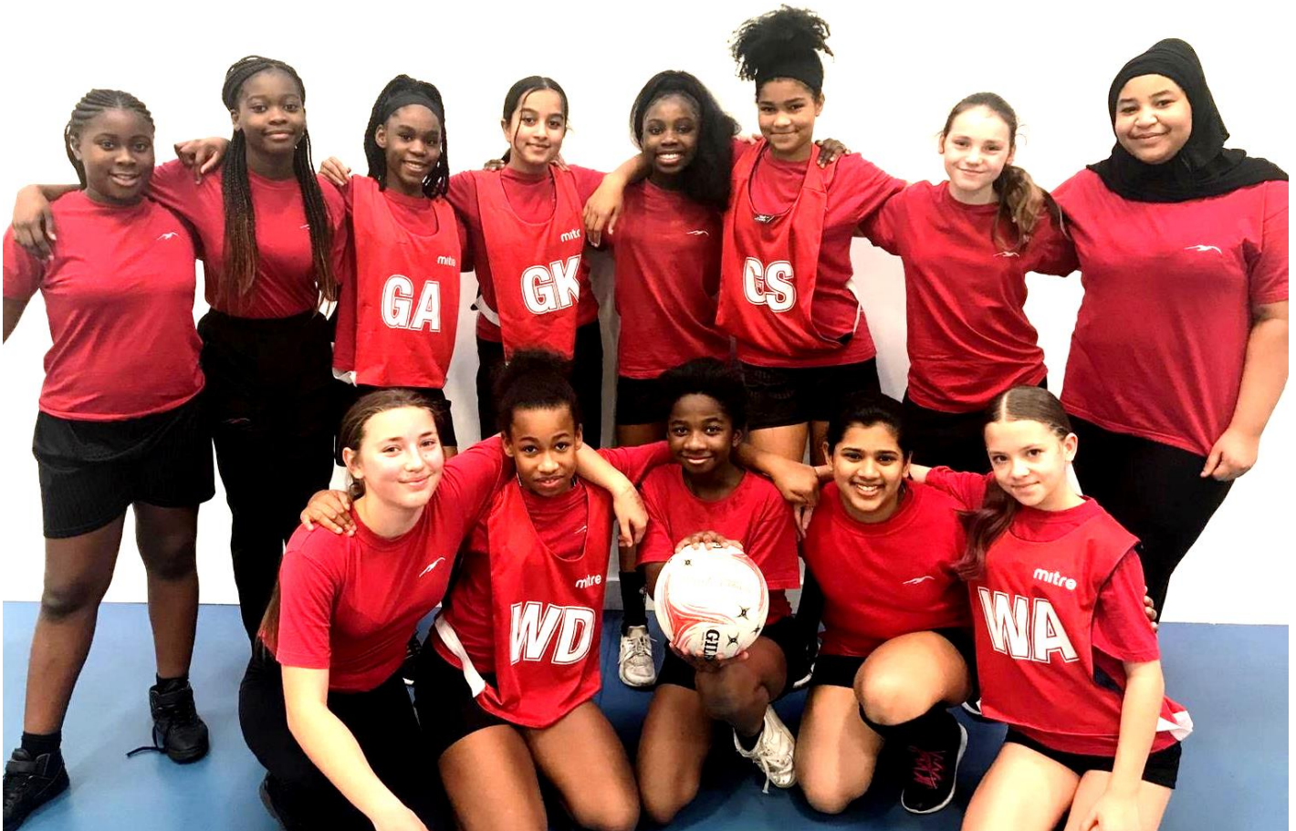
Year 7 Netball Team win yet another Essex Cup!