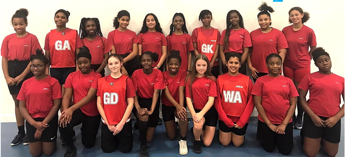
Year 7 Netball A and B Teams