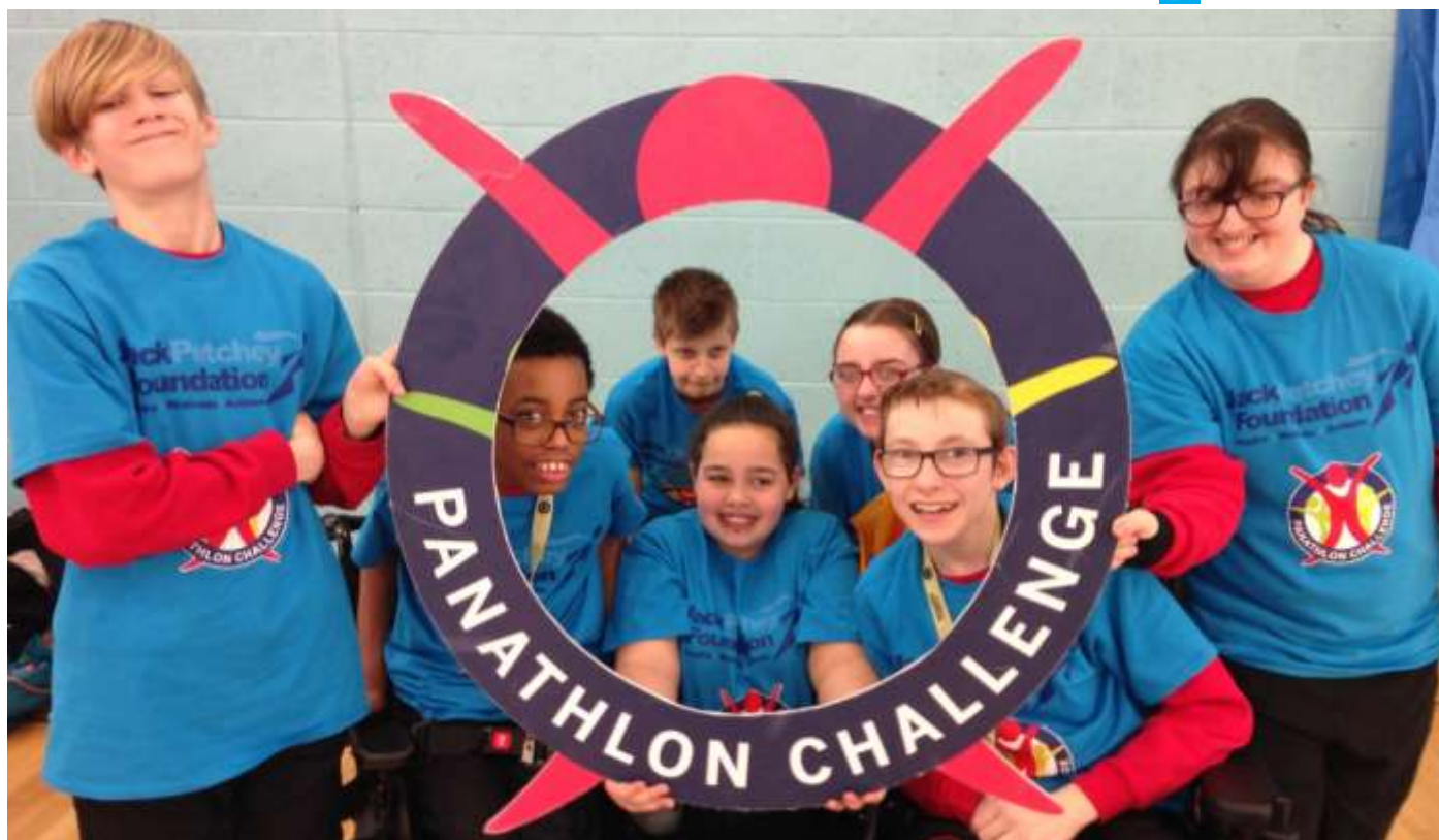
Victory at Panathlon Competition