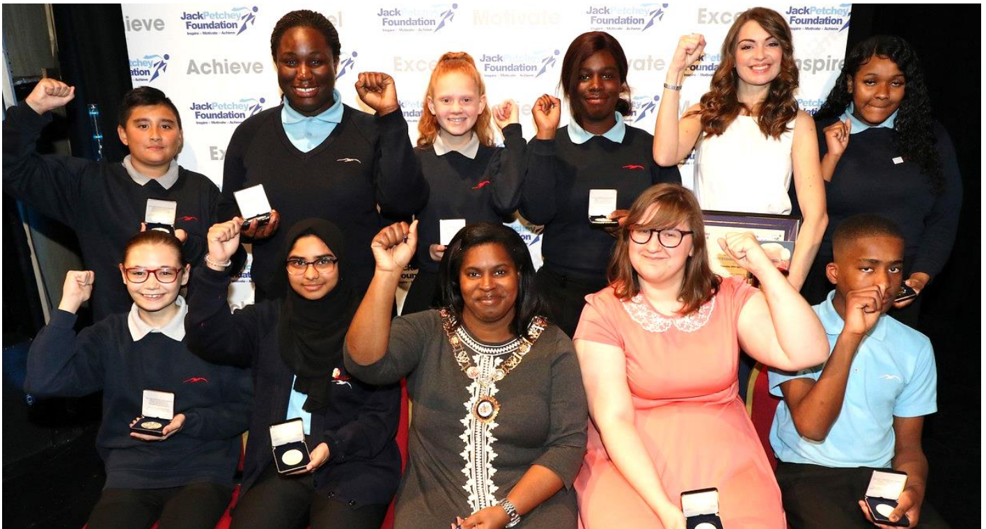
Jack Petchey Award Ceremony