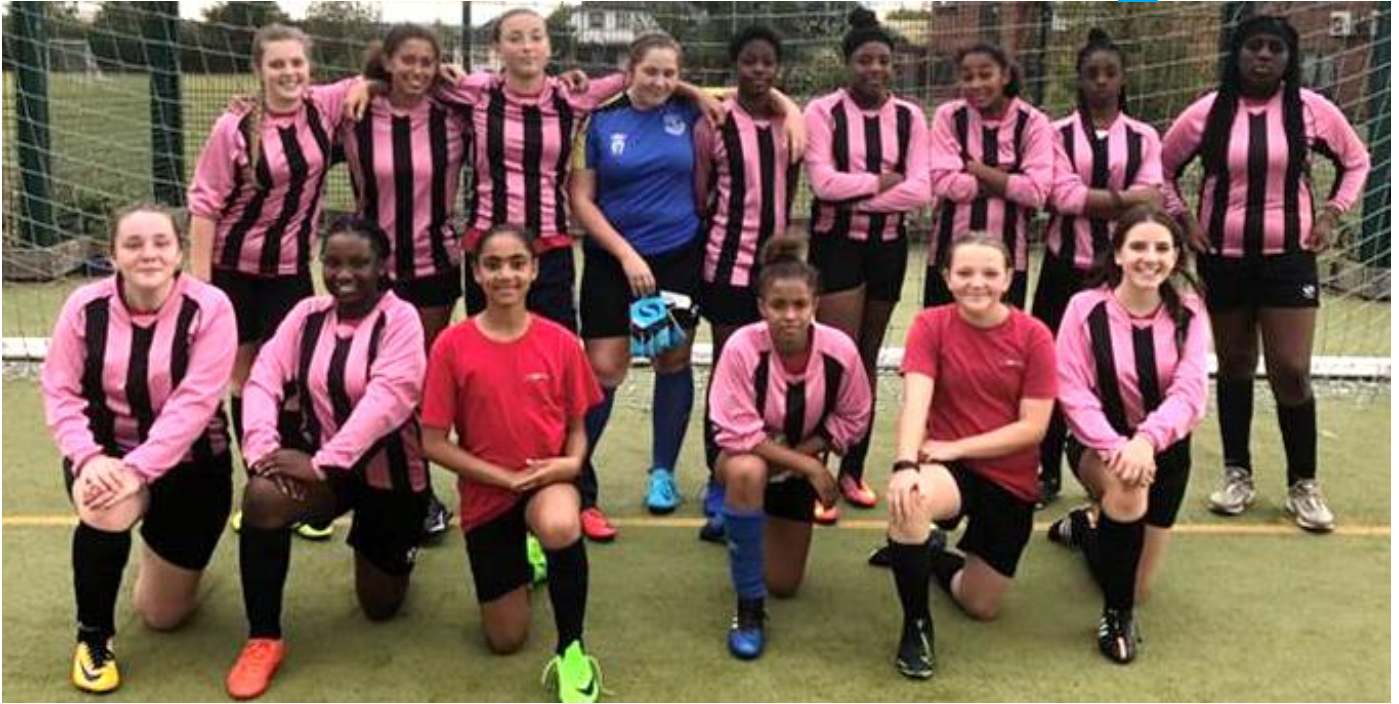
Under 14 Girls Football Team