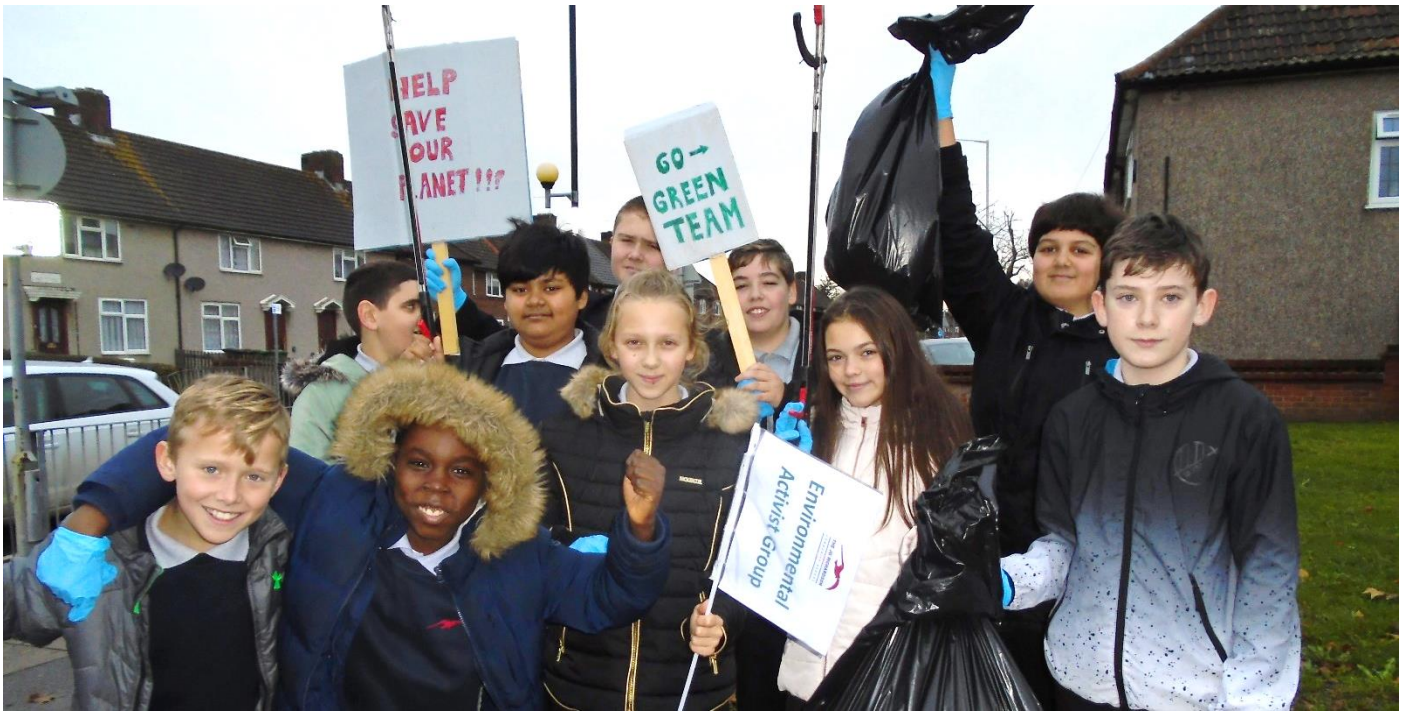
JRCS Environmental Action Group