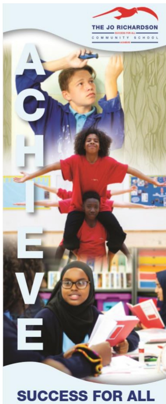
Miss England Head of Dance

Bring a bottle of water and clean trainers.