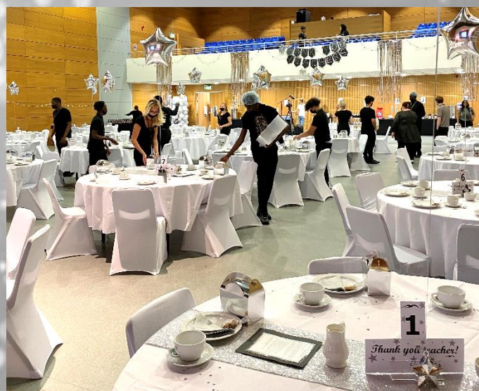
Boothroyd Hall preparation