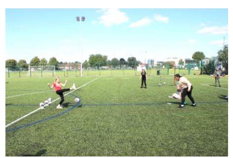
We have no doubt our Year 7s will take on further opportunities and put their best foot forward for the rest of the year.