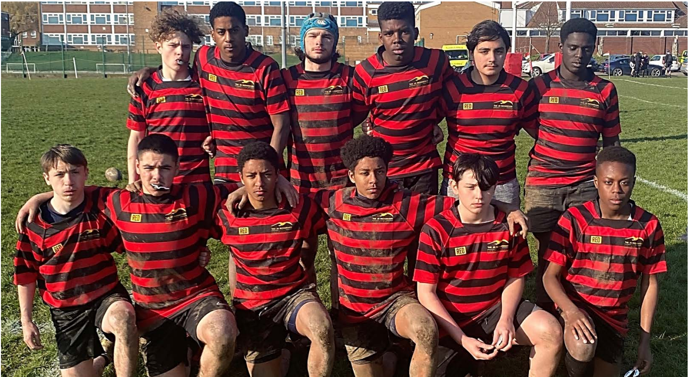
Year 10 Rugby Squad