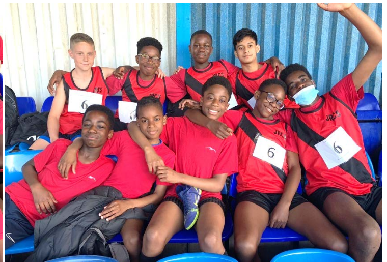
JRCS Borough Athletics