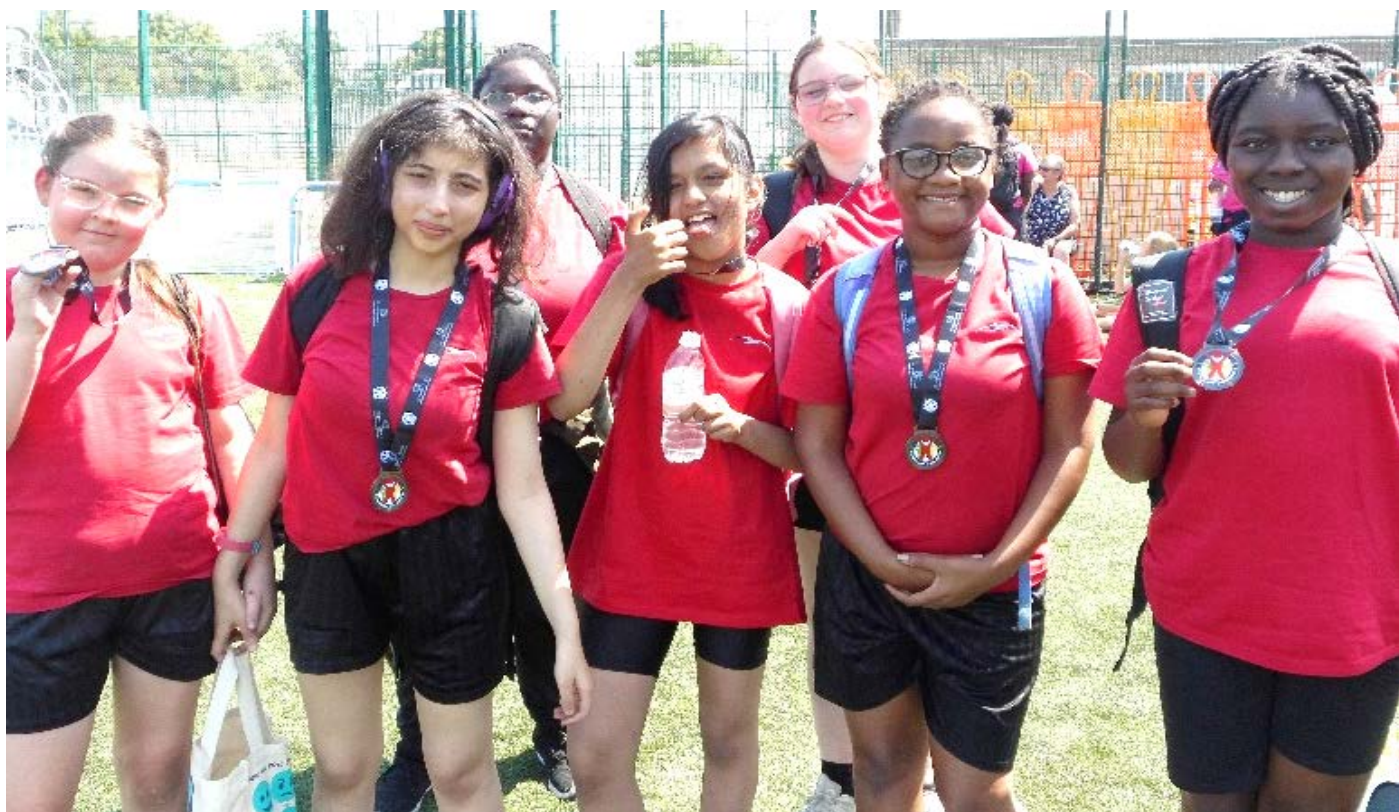
Girls Panathlon Football event