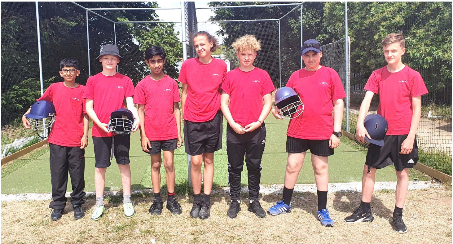
Year 7 Cricket Team