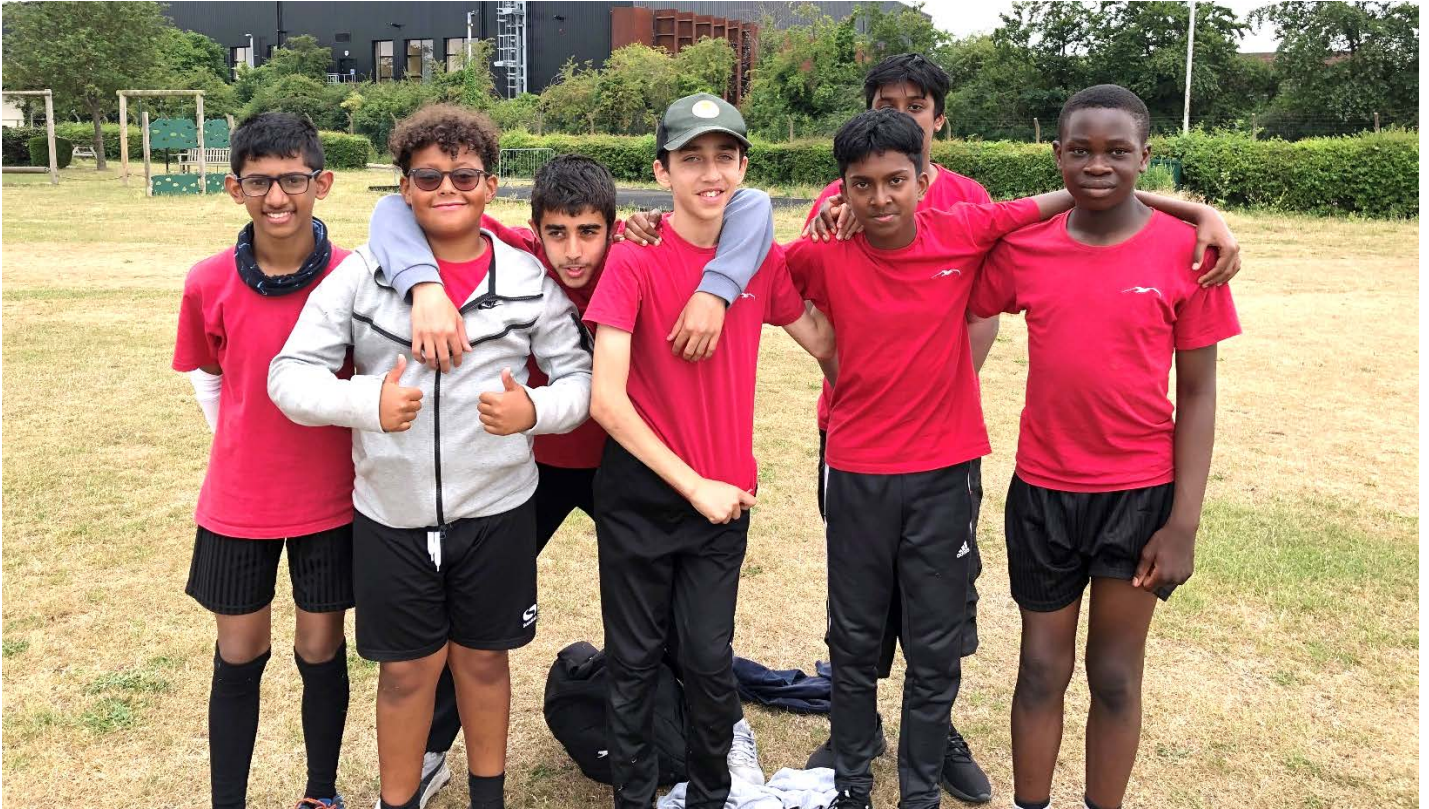
Year 8 Cricket Team