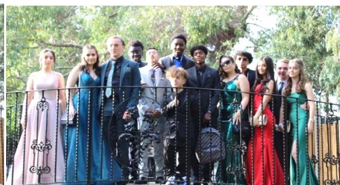
Year 11 Prom