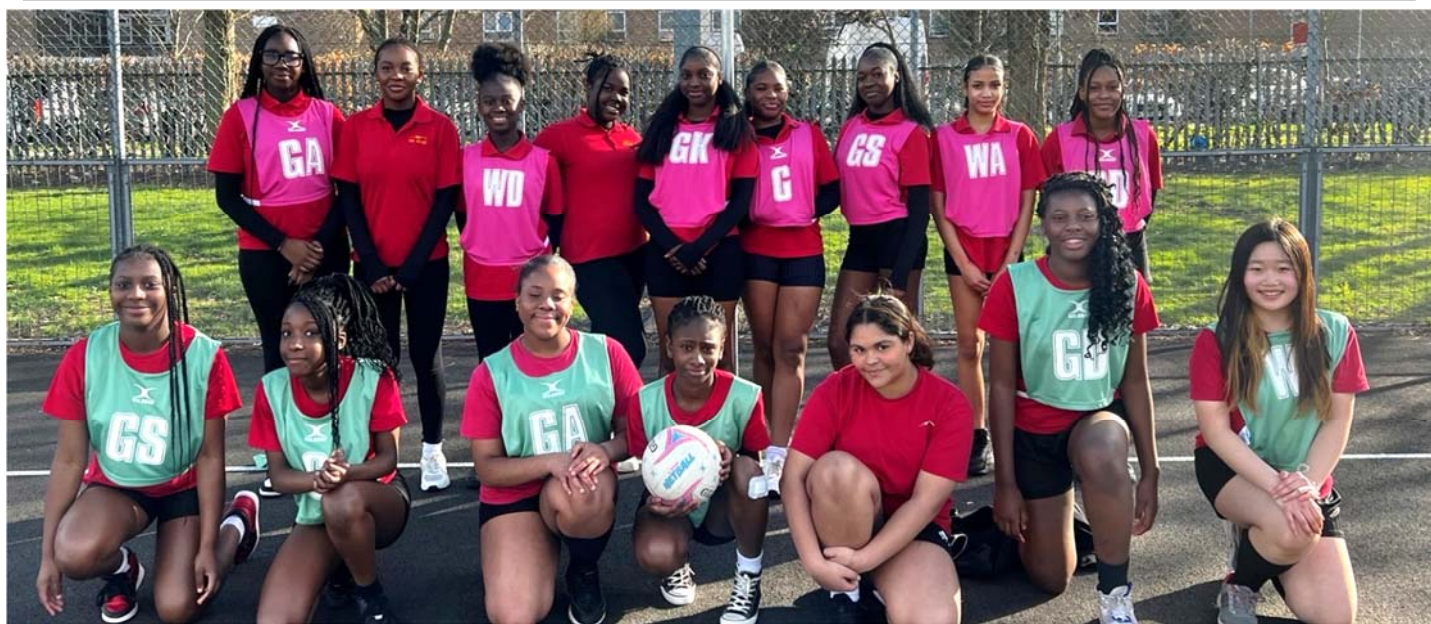
Year 8 and 9 Netball Team